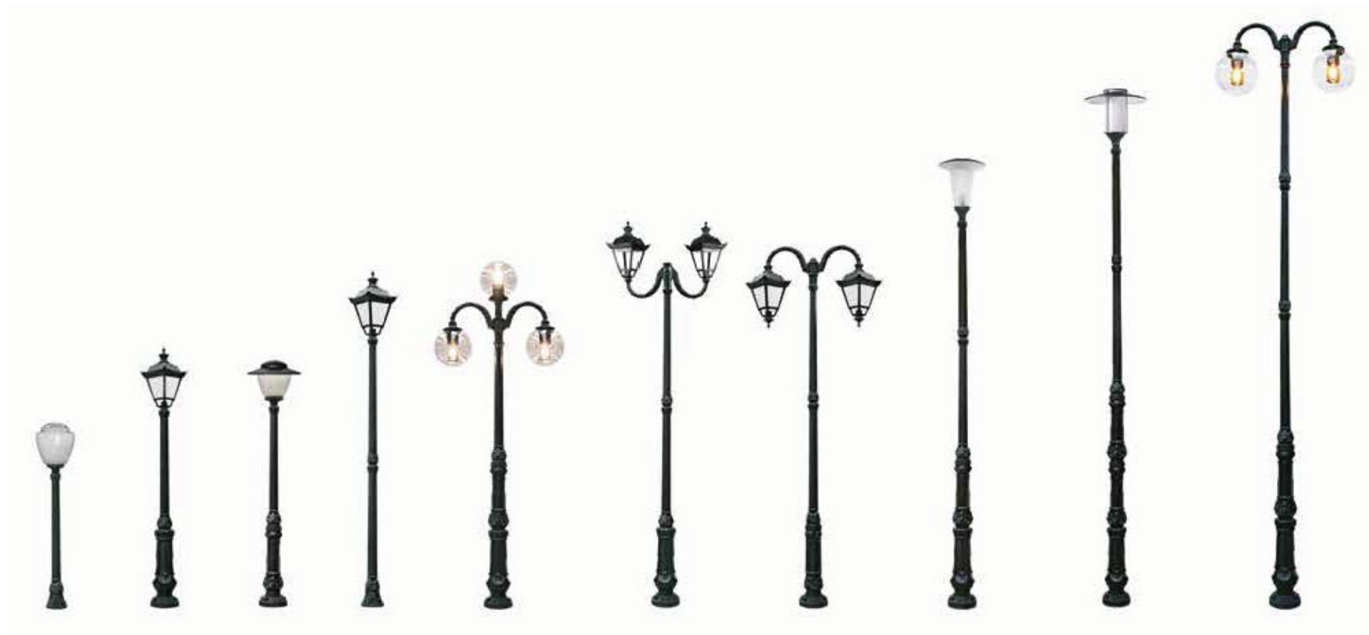
Pole S-13/B luminaire OP, lamp diffuser Klio white