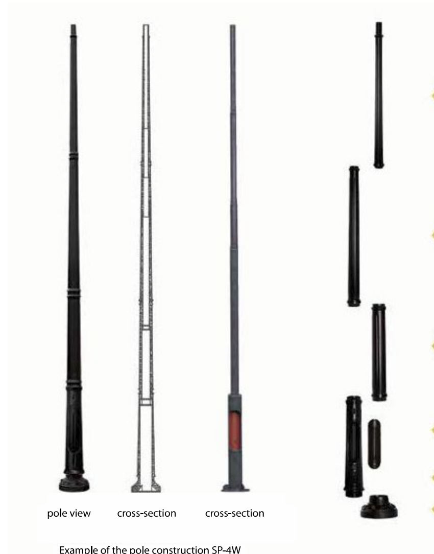
Example of the pole construction SP-4W