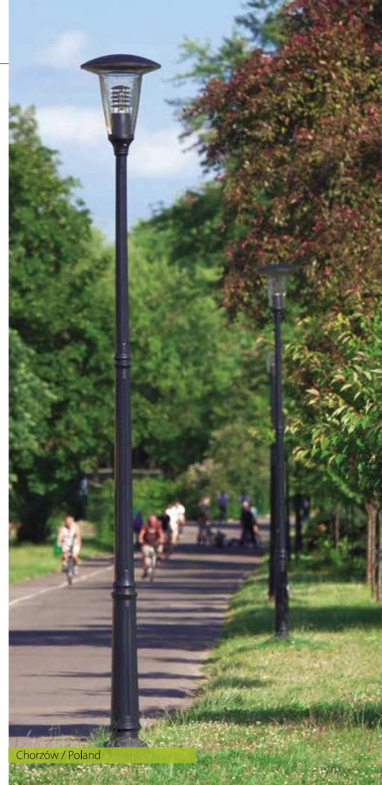
Pole SP-5W/E Extension arm WTM-20/2 Luminaires OW LED transparent lamp diffuser