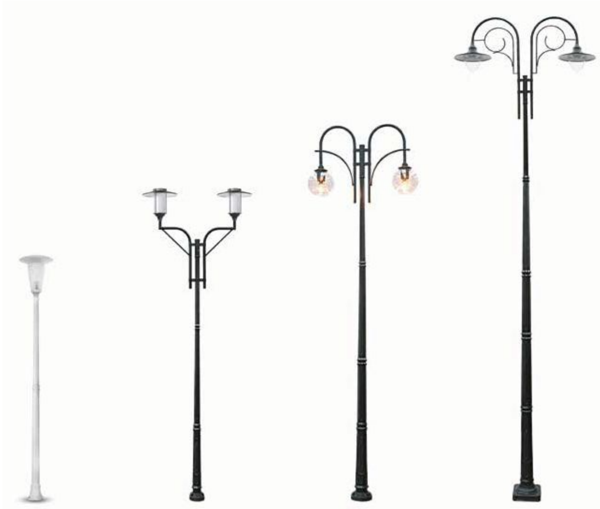
Pole SP-2/A Extension arm WT-2 Luminaire ATLANTIS LED