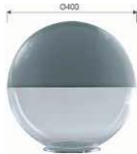
Sphere painted upwards