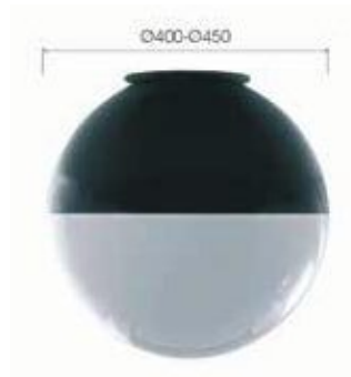
Sphere painted downwards